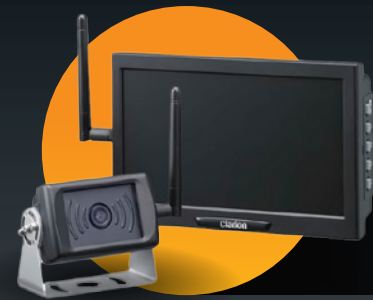
Wireless/ LAN Systems