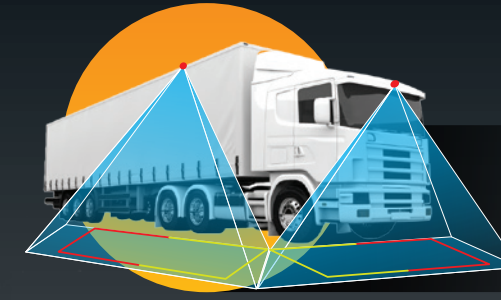
Blind Side Detection