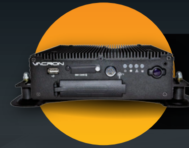
Mobile Surveillance Systems