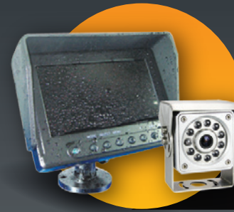
Heavy Duty Mining Systems