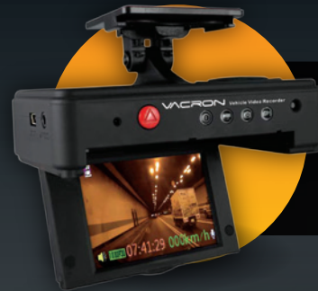
Single or Dual Dashcams