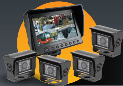
Split Screen Systems