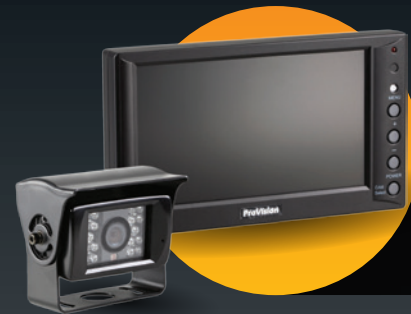
Single Camera Systems